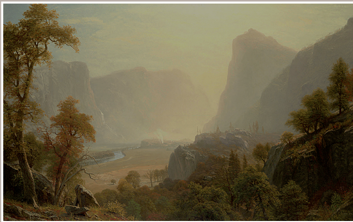
Albert Bierstadt Oil on canvas ca. 1890