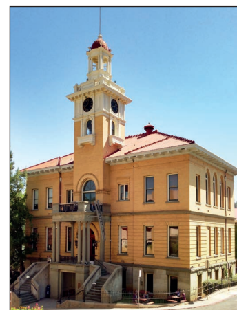
The historic Tuolumne County Courthouse in downtown Sonoma

San Francisco’s reticence to engage in substance comes as no surprise. Restore Hetch Hetchy’s immediate goal is to address and resolve the legal preliminaries as quickly as possible, and move into a hearing where we can present evidence that Hetch Hetchy is more valuable as a valley than as a reservoir.