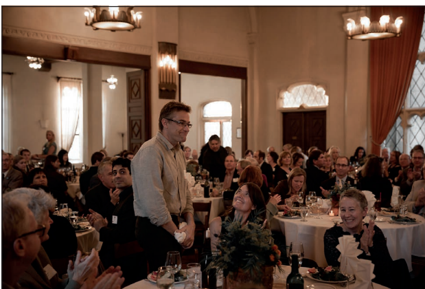
Our 2015 Event

SAVE THE DATE , or better yet buy tickets or reserve a table. We'll be back at the Berkeley City Club —a spectacular venue designed by architect Julia Morgan.