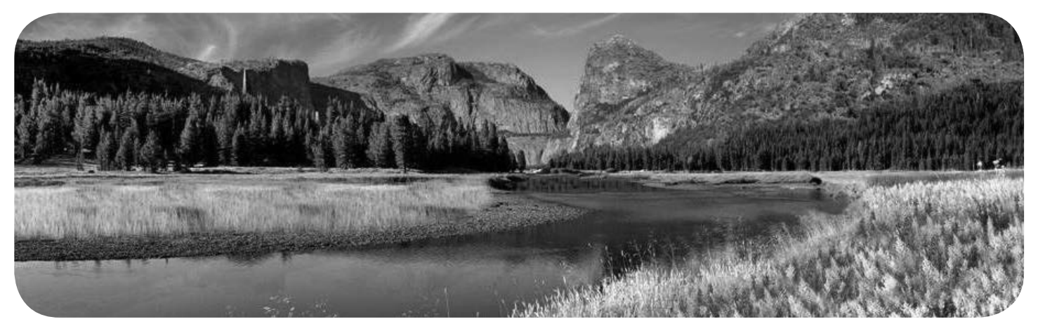
This artist's rendering shows what Hetch Hetchy Valley could look like after being restored and returned to the American public.

SF Voters, David Binder Research, August 2011