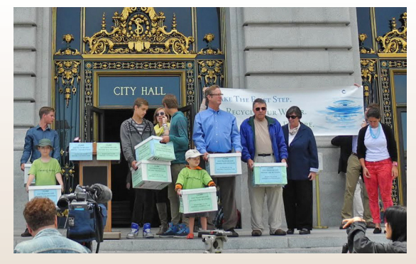
With media watching, volunteers deliver signatures to City Hall

Earlier this year, Restore Hetch Hetchy (RHH) launched a sister organization, the Yosemite Restoration Campaign (YRC), to actively and directly lead the campaign to pass the initiative, which is currently called the "Water Sustainability and Environmental Restoration Planning Act of 2012." If it passes, the city must develop a plan by 2015, which will then be placed before voters for approval in 2016.